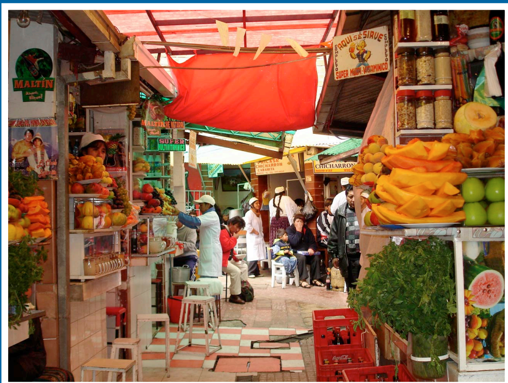
La Paz, Bolivia